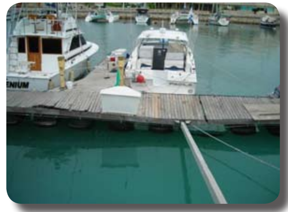
Walkway torn loose by surge and Med style moorings in background.

Electric and Water: Water is no problem at the floating docks or in the yard. Electric is an interesting mess for boats on the hard and in the Med style moorings. The outlets in