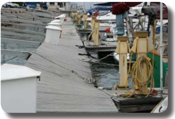
Docks flexing with the surge.

Floating Docks: There are floating docks, but no cruising boats stay at them for over a few days. There is a surge in the marina basin and it makes living aboard very uncomfortable. The docks twist and contort, making loud metal to metal noises. Boards and screws pop loose. In places, the docks twist and flex to a steep angle. It is something to see. We saw a Hunter Legend 40