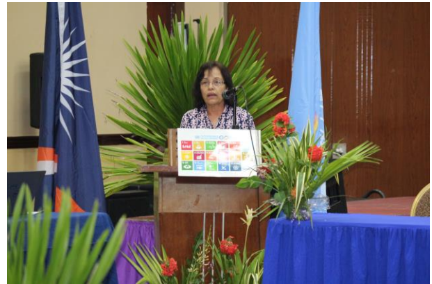
Photo: President Heine delivers her remarks at the final day of SDGs localization workshop Friday last week at the ICC

Minister-in-Assistance Mattlan Zackhras said an “island-tailored” strategy of national ownership – and stakeholder partnership – is needed.